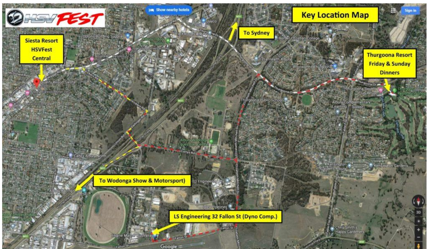
HSVfest Key Location Map – Albury / Thurgoona NSW

Entries Close midnight Sunday 1st August 2021